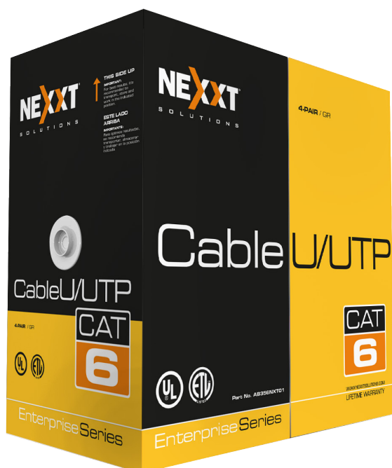
AB356NXT01 AB356NXT02 AB356NXT03